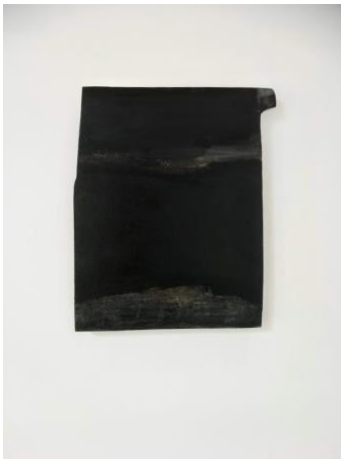
11. Rose Moxham Surfacing on the white bay 6 (Grey beacon) , 2021 Mixed media on cotton rag on wood 35x28cm $440