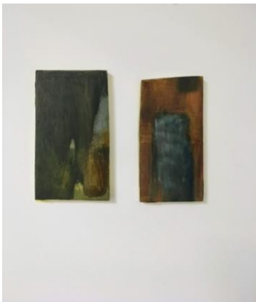
15. Rose Moxham Surfacing on the white bay 10 (diptych) , 2021 Oil on wood 35x28cm 31x25cm $440