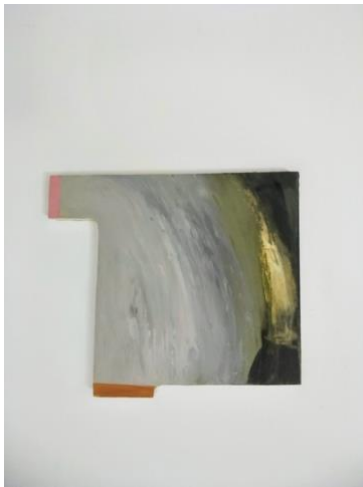
2. Rose Moxham Surfacing on the white bay (the fallen sky 2) , 2021 Oil on wood 24x28cm $380