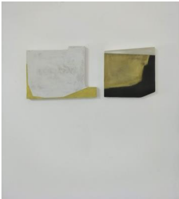
18. Rose Moxham Surfacing on the white bay 14 (diptych) , 2021 Oil on wood 18x25 19x18cm $620