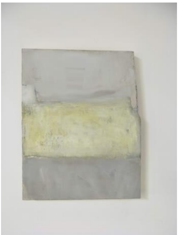
8. Rose Moxham Surfacing on the white bay 2 , 2021 Oil on wood 35x28cm $440