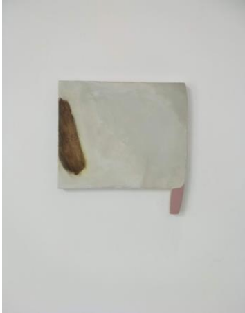
7. Rose Moxham Surfacing on the white bay (the fallen sky 3) , 2021 Oil on wood 27x26cm $380