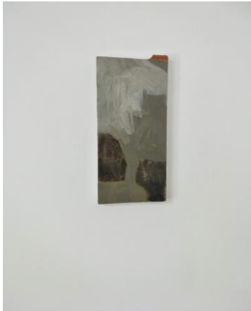
Surfacing on the white bay 15, 2021 Oil on wood 26x13cm $380