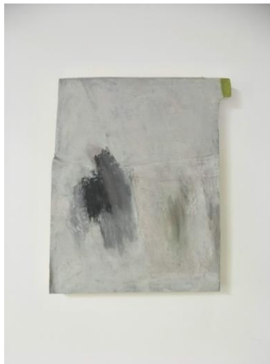
5. Rose Moxham Surfacing on the white bay (Green beacon) 4 , 2021 Oil on wood 35x28cm $440