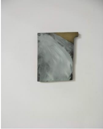
22. Rose Moxham Surfacing on the white bay 18 (Swept away) , 2021 Oil on wood 20x17cm $380