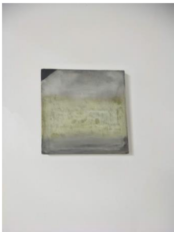
24. Rose Moxham Surfacing on the white bay 20 , 2021 Oil on wood 19x18cm $380