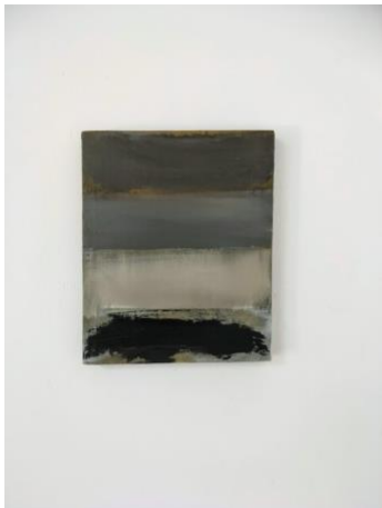
20. Rose Moxham Surfacing on the white bay 16, 2021 Oil on wood 18x15cm $380