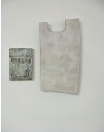
13. Rose Moxham Surfacing on the white bay 8 (diptych) , 2021 Mixed media on wood 7x12cm 40x22cm $620