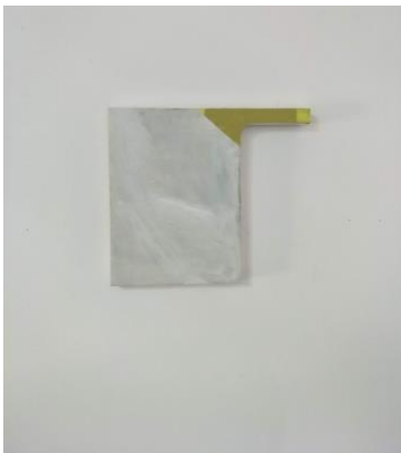
14. Rose Moxham Surfacing on the white bay 9 (yellow beacon) , 2021 Oil on wood 35x28cm $440