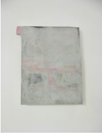
25. Rose Moxham Surfacing on the white bay1 (Pink beacon) , 2021 Oil on wood 35x28cm $440