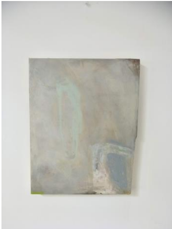
9. Rose Moxham Surfacing on the white bay 3 , 2021 Oil on wood 35x28cm $440 (SOLD)