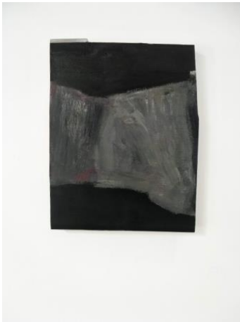
12. Rose Moxham Surfacing on the white bay 7 (White beacon) , 2021 Mixed media on cotton rag mounted on wood 35x28cm $440