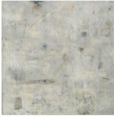
1. Rose Moxham On the white bay , 2020 Oil and cold wax on wood panel 122x122cm $3200