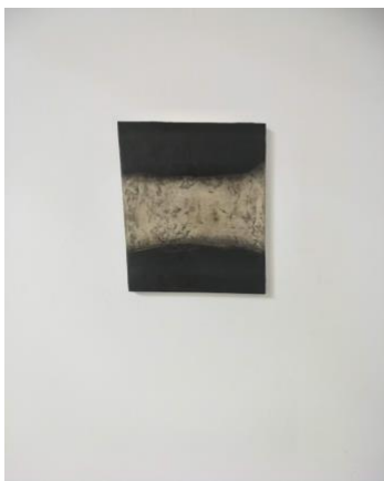
21. Rose Moxham Surfacing on the white bay 17, 2021 Oil on wood 20x18cm $380