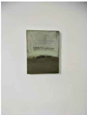
23. Rose Moxham Surfacing on the white bay 19 , 2021 Oil on wood 20x15cm $380