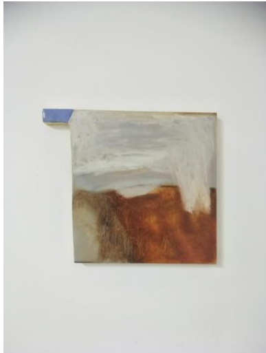
4. Rose Moxham Surfacing on the white bay (the fallen sky) , 2021, Oil on wood 25.5x22cm $380