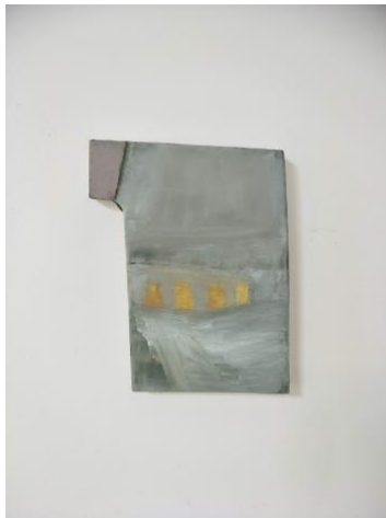
3. Rose Moxham Surfacing on the white bay (Lilac beacon) , 2021 Oil on wood 20x16cm $380 (SOLD)