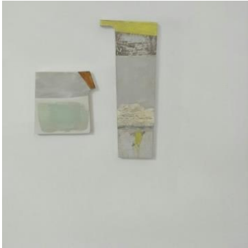
17. Rose Moxham Surfacing on the white bay 12 (diptych) , 2021 Oil on wood and mixed media on cotton rag and sandpaper, mounted wood 39x16 10x40cm $620