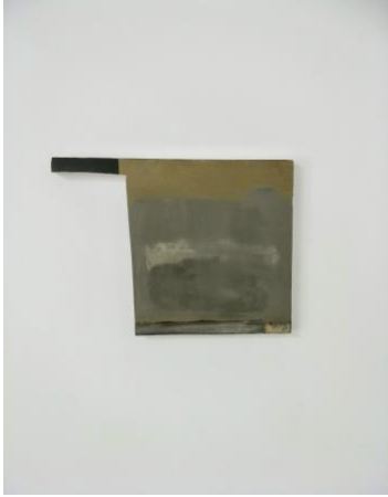
16. Rose Moxham Surfacing on the white bay 11 (black beacon) , 2021 Oil on wood 21x30cm $380 (SOLD)