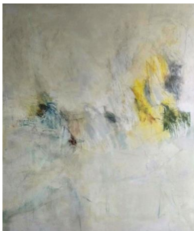
6. Rose Moxham Surfacing on the white bay (Saddleback) , 2020 Oil on wood panel 122x102cm $2600