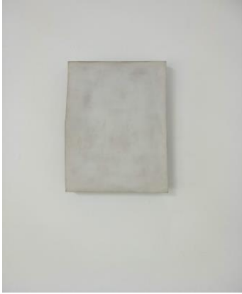
10. Rose Moxham Surfacing on the white bay 5 , 2021 Mixed media on wood 28x22cm $380